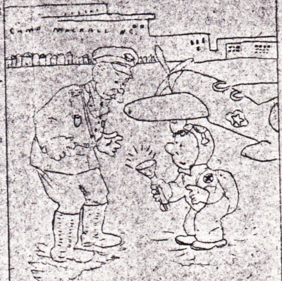
"WHEN WE JUMP AT NIGHT, SINCE I WOULD LIKE TO SEE IF MY PARACHUTE OPENS!"