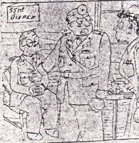
"HE WON'T STICK HIS TONGUE OUT AT ME BECAUSE I'M AN OFFICER!"